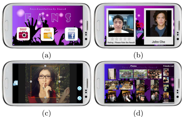
Figure 3: (a) Interface of the mobile application, (b) Annotation result using a captured photo, (c) Edit and crop image, and (d) Access the photo albums on the Facebook.

trieval database. The middle number indicates the similarity value between the query image and the most similar facial image. By clicking the Facebook button below the similar number, users can share the annotation results with their friends via social networks. FANS also allows users to rate the annotation results in FANS App. In particular, under the query image, a bar of five star is given to let users vote the annotation result. For a large size image, users can crop out the facial image region with FANS App as the query image, as shown in Figure 3 (c). By clicking the second button or the third button, users can respectively access the album images in the mobile device or in their Facebook account, so as to explore facial images as queries to interact with FANS, as shown in Figure 3 (d).